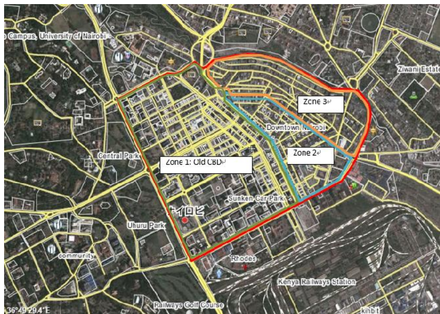
Figure-1: The data collection zones in Nairobi CBD

Data on names of buildings and streets was obtained from existing maps. However, some names were missing and therefore field data collection in the CBD was done to fill in the remaining names. During the field work, the CBD was divided into three zones as shown in figure 1. The researchers worked in pairs, taking the spatial location of the missing street names and recording them on a base map. In total 73 street names were recorded.